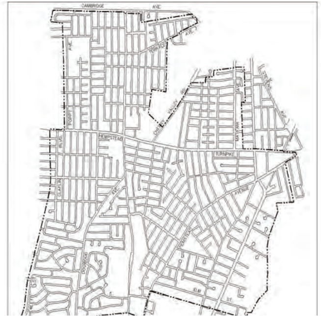
WEST HEMPSTEAD WATER DISTRICT AREA

The Commissioners of the West Hempstead Water District are responsible for its overall operation and finances. The day-to-day operation and the mandated license is the responsibility of the District Superintendent. The population and pumping capacity of the West Hempstead Water District requires the Superintendent to have a Grade 1A and B Public Water System Operator's Certification. This certification or license is issued to the individual by the Department of Health of the State of New York. Requirements for this certification include successful completion of academic studies in all aspects of the water industry and a minimum of 10 years experience in the water works field. Additionally, all individuals at the West Hempstead Water District who operate any aspects of the plant have a Grade D and Grade 2-B New York State Certified Water System Operator Certification. The requirements to obtain this certification are similar to that of the Superintendent, but not as detailed. Some plant operators also have a Grade 1B New York State Certified Water System Operator Certification.