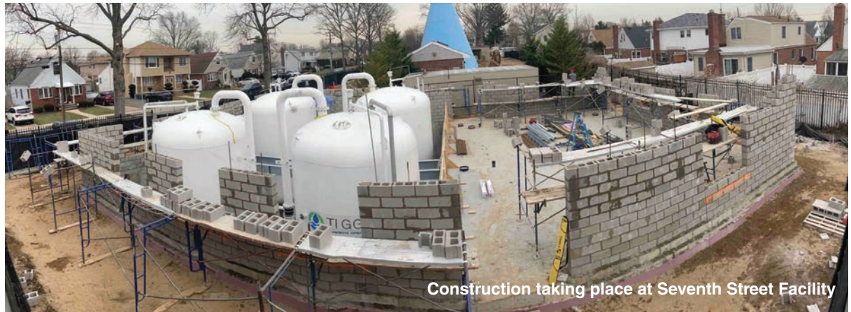
Construction taking place at Seventh Street Facility

The West Hempstead Water District has been maintaining and delivering the highest quality water to the residents of West Hempstead, Garden City South and a large portion of Franklin Square since 1926. That's 95 years of dedicated and professional service.